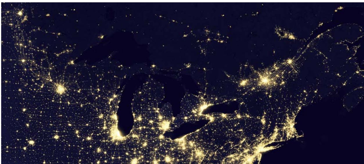
VIIRS Night Global Black Marble