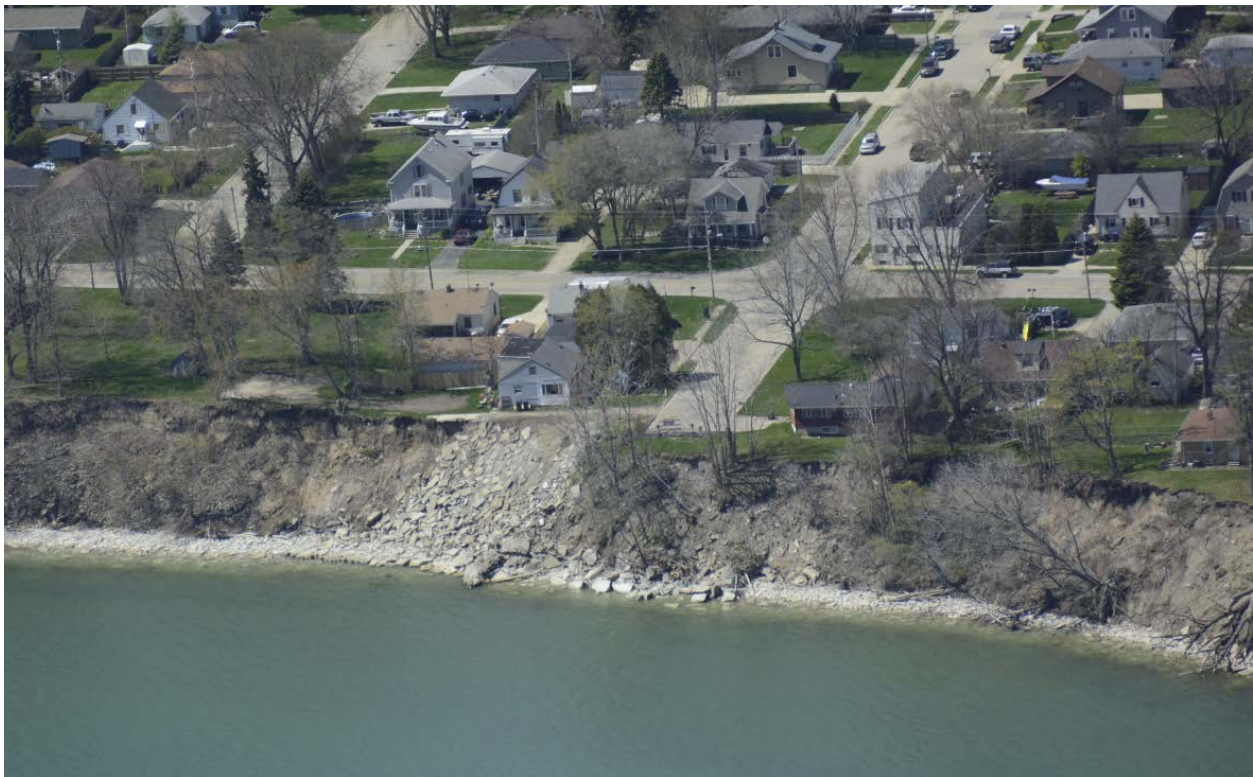
Coastal Bluff in Racine County in 2017.

An important accomplishment of the project was the development of methods for inventory, acquisition, and integration of existing local government spatial data for use in decision-making about regional-scale issues. Significant barriers to the development of an integrated coastal management GIS application utilizing local government spatial data were exposed, including the cost of data acquisition, the time required to receive data after the request is made, and restrictions placed on the use and dissemination of digital data. Nine technical issues were identified that affected the ability to integrate digital spatial data for use in analysis and decision-making related to regional-scale issues. The five spatial analyses using integrated data could only be completed in a partial manner due to incomplete data availability. While the findings painted a mixed picture of whether local government spatial data could be effectively inventoried, acquired and integrated to support analysis and decision-making about coastal issues at a regional scale, the research did provide an early test of land information integration in Wisconsin. Upon completion, the project served as a spark for creation of the local geospatial data collection at the Robinson Map Library.