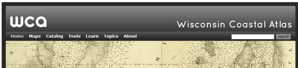
Wisconsin Coastal Atlas ( http://wicoastalatlans.net/ )

The primary motivation of the research is demonstrating that a coastal web atlas can serve as an interoperable resource both internally and externally. The atlas leverages local government data and integrates it to address regional and statewide issues. In addition, the atlas shares data at broader scales ranging from the Great Lakes to global. The latter is demonstrated through active collaboration with the International Coastal Atlas Network ( http://ican.iode.org/ ).