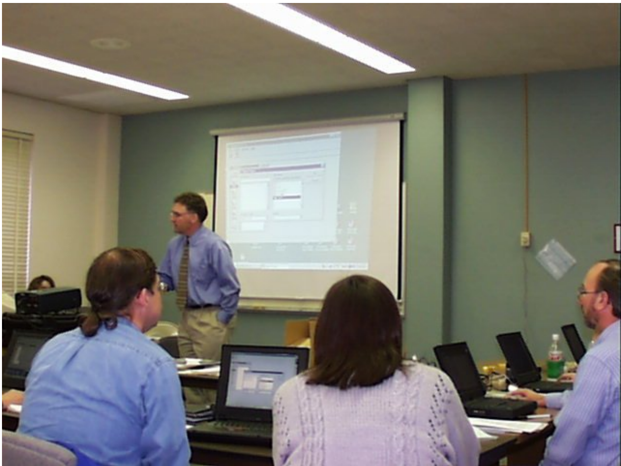
Coastal GIS Training in Door County in 1999.

Meetings with land information officers in coastal counties at the start of the coastal GIS outreach project in 1995 uncovered a strong interest and need for GIS training. Although staff indicated that adequate resources existed to support GIS hardware/software acquisition and database development, training funds were scarce in most county budgets. Specific training interests included getting started with a new GIS software package and, in cases where spatial database development was more advanced, applying GIS to specific coastal issues. As a result dozens of GIS training sessions were held in Madison and coastal counties including Bayfield, Ashland, Door, Kewaunee, Manitowoc and Racine. The training sessions featured local land information used for GIS applications such as shoreland management, coastal erosion and urban nonpoint pollution. Participants found GIS training that leveraged familiar local data for relevant local issues was highly effective.